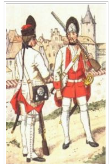
Grenadiers of the Kreisinfanterieregiment Fürstenberg in 1735.